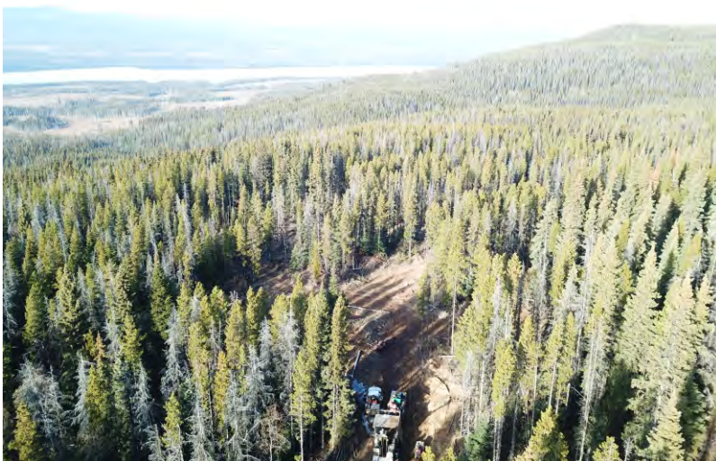
View of the Gibson area looking north