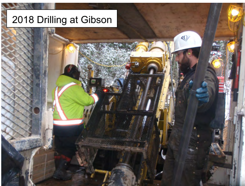
2018 Drilling at Gibson