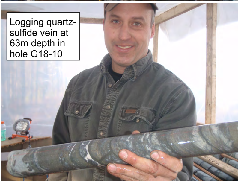
Logging quartz-sulfide vein at 63m depth in hole G18-10