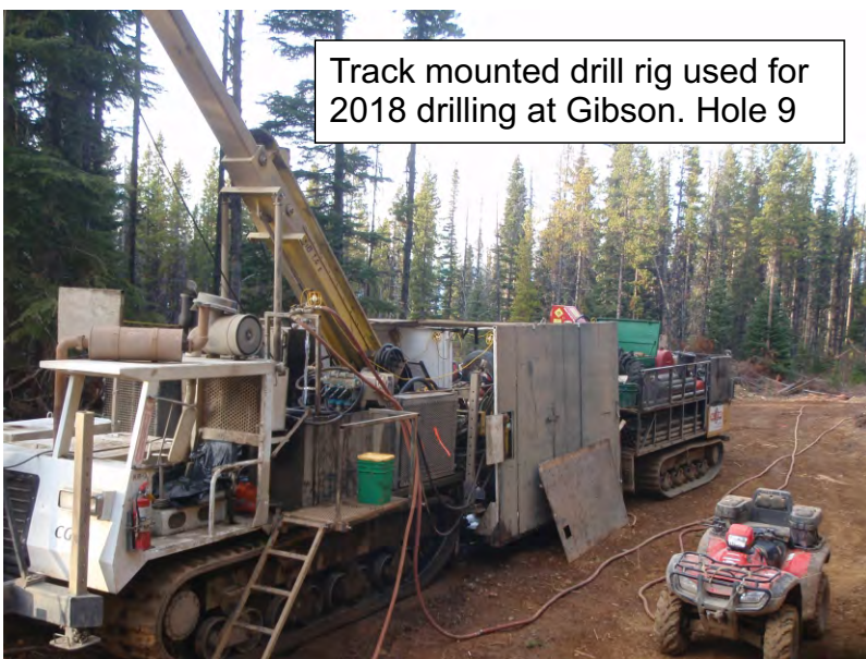
Track mounted drill rig used for 2018 drilling at Gibson. Hole 9