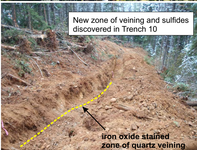
New zone of veining and sulfides discovered in Trench 10