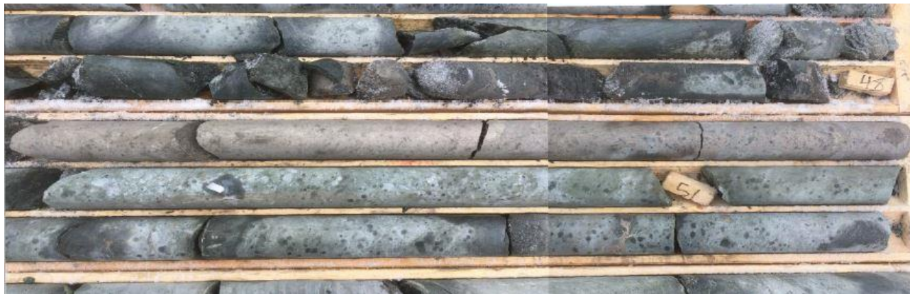
Figure 4: Section of hole 21-18 drill core included in this release.