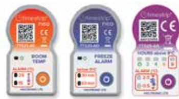
Timestrip's new specialist indicators and the original product (right)

Timestrip® has added to its recently announced neo platform with two new stocked products. The Freeze Alarm is designed for products that are sensitive to freezing, and provides a visible alert if the ambient temperature drops below 0°C for 30 minutes; it shows a further alert at 60 minutes. The Room Temp indicator monitors the range 15 to 25°C, and alerts at one hour.