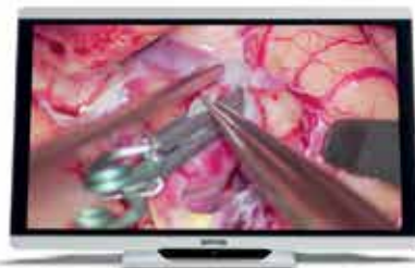
Barco MDSC-8427 LED 27" 4K Surgical Monitor

Shop surgical monitors ONLINE No waiting Transparent pricing