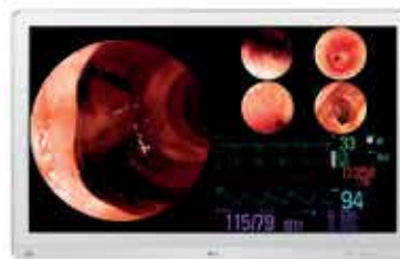
LG 32HL710S 31.5" 3G-SDI - 4K Surgical Monitor"