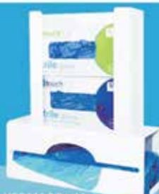
VGDA14-2 Double Glove Box & Apron Dispenser with Lifelong Antimicrobial Protection

Our British made products inhibit growth of MRSA, E.coli, Legionella, Salmonella and Mould by up to a PROVEN 99.9% and continue to control bacteria 24 hrs a day, 7 days a week.